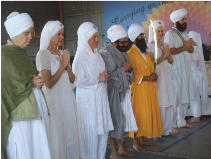
Sikh Dharma Ministers Working in Unity and Purity to Serve Humanity

“Your reliability will give people the courage to trust you. Their trust will give you the power to carry a situation. A leader carries and serves people. Learn to lead as a ‘seva’ (to sacrifice your time and resources for the benefit of others without wanting anything in return); people will love you, and you will continue to expand.”